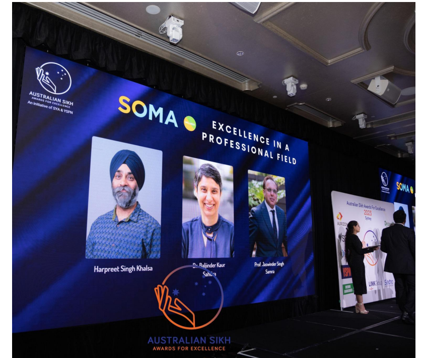
Platinum Award Sponsor Branding Example

TBA Awards are presently available for sponsorships.