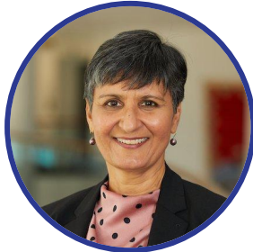
Harinder Sidhu Australia's High Commissioner to New Zealand NZ